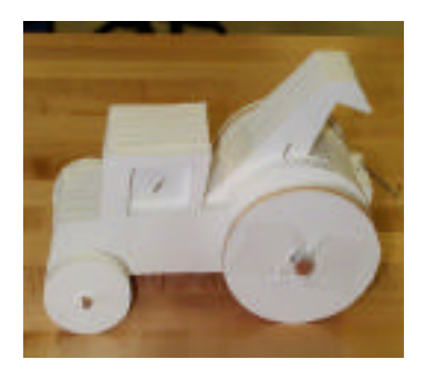
Tow truck (Default)