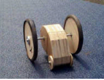
Puth's Car (Spring 2000)