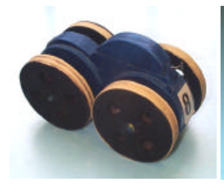
The Bug (Autumn 2000)