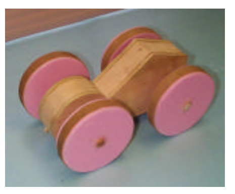
Pinky (Winter 2001)