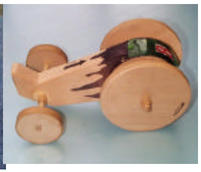
Balsa Racer (Autumn 2000)