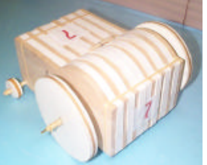
Crate (Winter 2001)